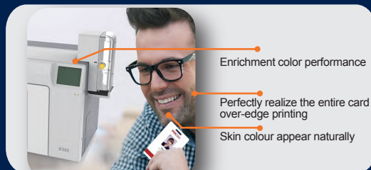
Dye-sublimation transfer printing technology

Alarm for no card, defective card slot Manual feeding card on back end and recycling pending card Available to set the direction of output card